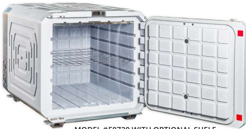
MODEL #F0720 WITH OPTIONAL SHELF