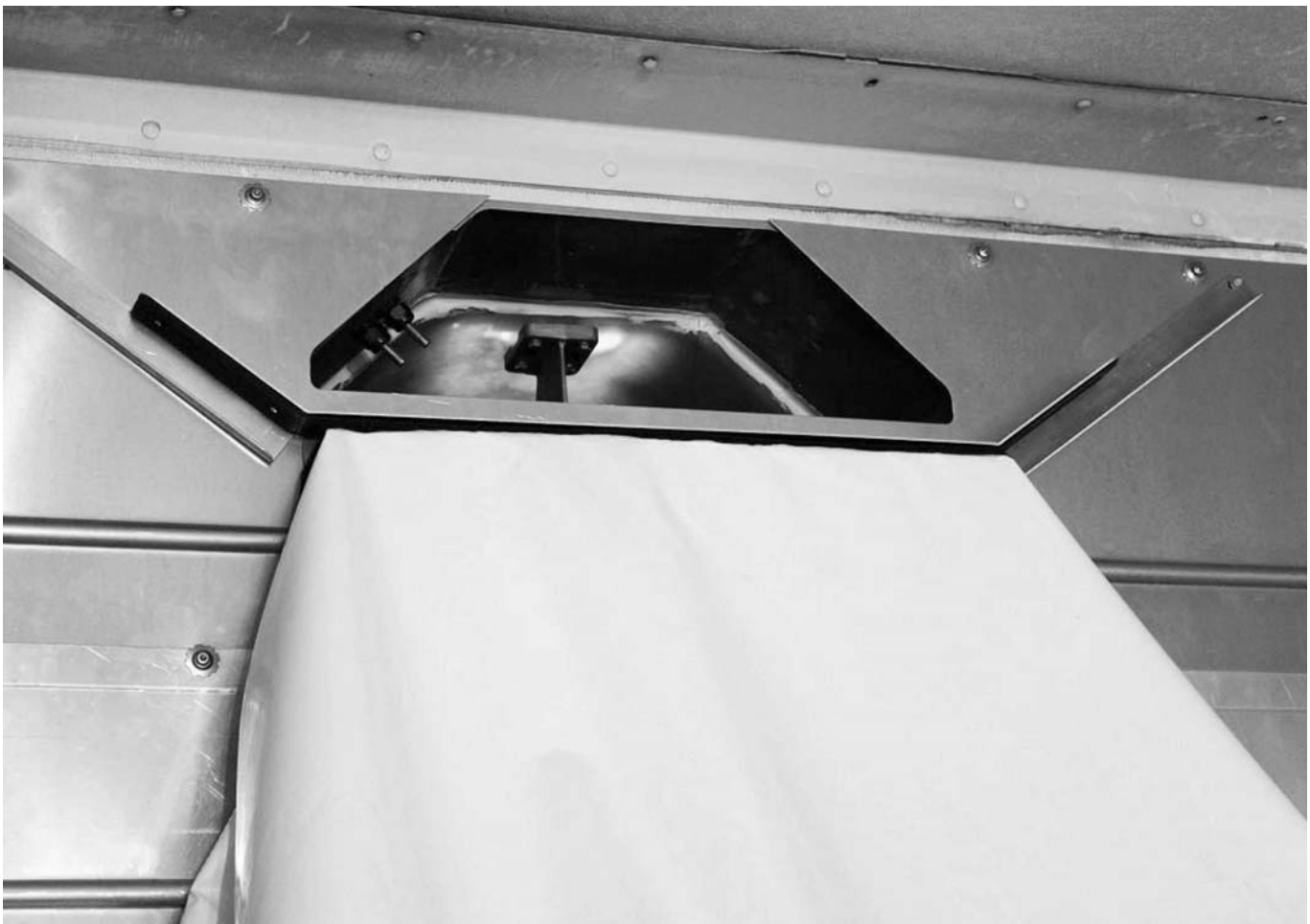
Figure 1: Bracket with chute attached to rear of unit.