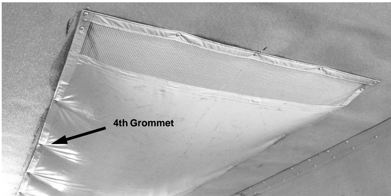
Figure 5: End of air chute shown installed flat and properly secured.