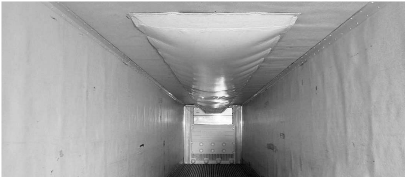
Figure 6: Completed air chute installation shown.