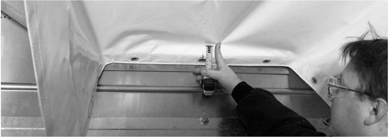
Figure 2: Chute slack in front of air outlet should be 1.00 in. to 2.00 in.