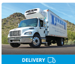
T-90 Series • B, V and E-Series Temperatures: -20°F+