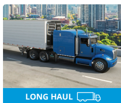
Precedent® Series • SLXi Series Temperatures: -30°F+

As more consumers move toward the adoption of home delivery services, Thermo King has products and services that can help you safely transport products throughout the cold chain.