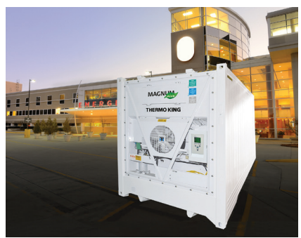
Magnum® Plus or Superfreezer - For mobile, temporary cold storage for larger quantities at temp ranges from -70C to +40C.