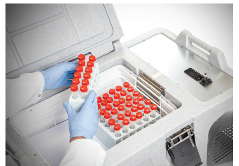
Coldtainer from Thermo King - For use in trucks, vans, or within hospitals. Storage temps ranging from -24C to +30C.

We offer several mobile refrigeration and storage units that can safely transport pharma cold chain products in any environmental condition. Whether you need a blood transport cooler, portable vaccine refrigerator, cooled transport of biological samples, or temperature-controlled shipping unit for vaccines and medicines, we have a solution.