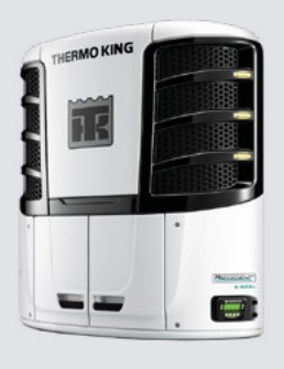
Precedent® S-600 / S-610M / S-610DE Precedent C-600 / C-600M