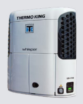
SB 130/230/330 and Spectrum SB