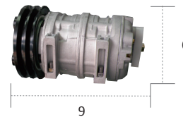
Swash Plate Compressor TK-21